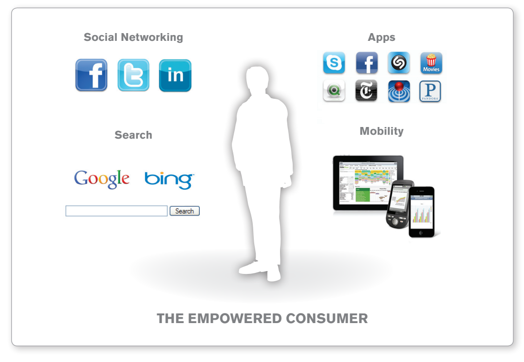
Figure 2: Empowered consumers are driving change